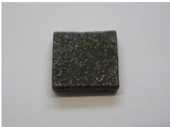
Figure 6. Efflorescence glazed 3D printed tile