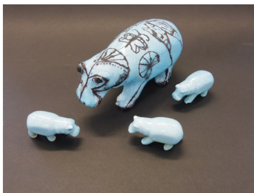
Figure 4. 3D scanned model of hippopotamus and 3DP Faience models

A model of a faience hippopotamus bought from the Metropolitan Museum of Art was obtained, photographed and uploaded. The subsequent 3D file was processed to produce a watertight 3D computer model, this was 3D printed in ceramic, covered in efflorescent glaze slip stained with copper carbonate, decorated with manganese dioxide stain and fired.