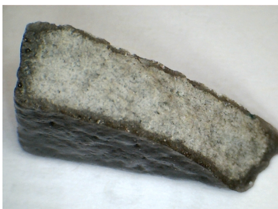
Figure 7. Section showing glaze surface