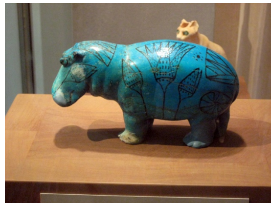
Figure 3. Faience hippopotamus Metropolitan Museum New York

To demonstrate this technique it was decided to try to 3D print and glaze a classic Faience object, the Nile hippopotamus examples can be found in museums all over the world.