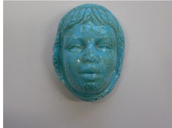
Figure 2. Egyptian Faience test body with copper carbonate stain

Early experiments have resulted in success with an Egyptian Faience body recipe produced by conventional ceramic forming techniques; with a self-glazed copper carbonate stained body being fired at 950 deg. C.