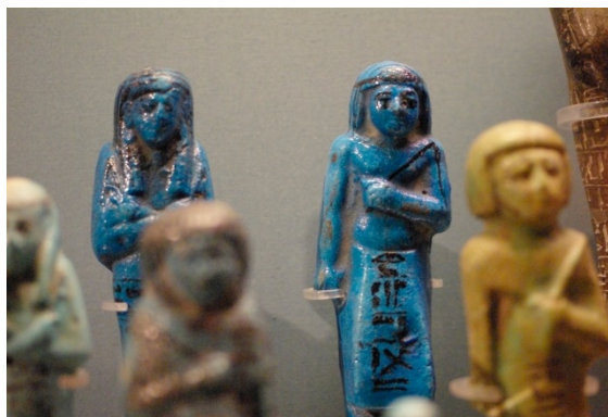
Figure 1. Egyptian Faience Shabti British Museum

The Egyptians referred to Faience as ‘tjehnet’, meaning that which is brilliant and scintillating like the sun, moon and stars [3]. To the ancient Egyptians, the sun was a symbol of resurrection, and its link to Faience explains why this material was used to create funerary figurines (shabti) to accompany the dead. The turquoise blue colour associated with the earliest Faience is also thought to be symbolic of rebirth and fertility. [4]